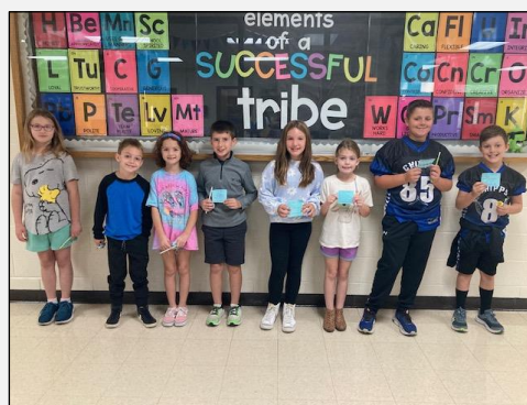
Caught Being Kind