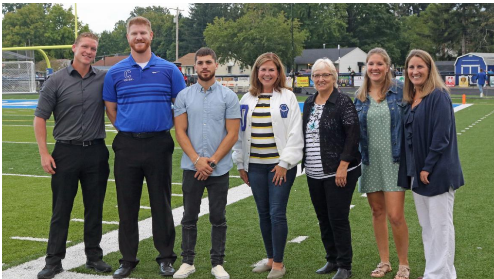
2023 Athletics Hall of Fame Inductees